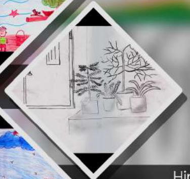
Hira VI C