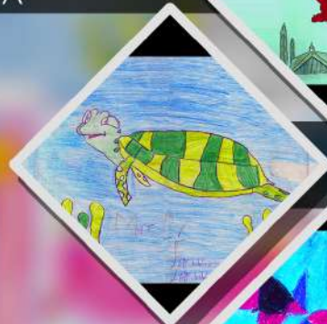
Mujtaba VII A